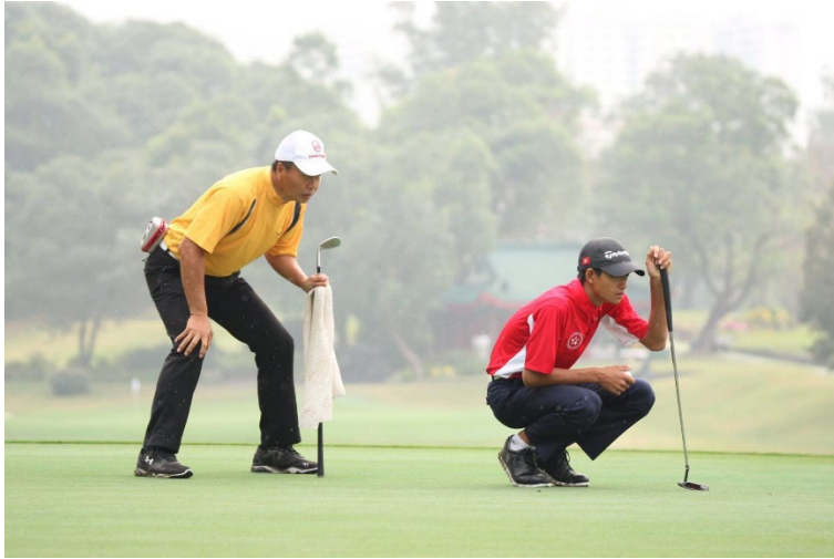
Father and son team