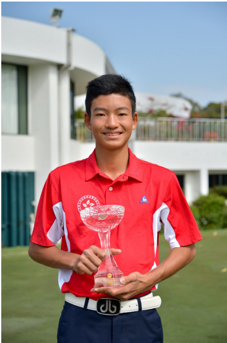
Champion of HKPGA 2016, 1 st Amateur in Hong Kong to win the PGA tournament