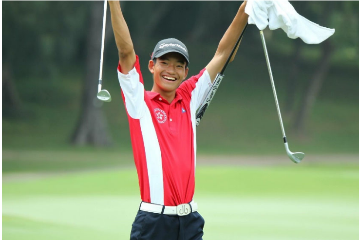
Champion of Hong Kong Junior Open 2016 and 2018