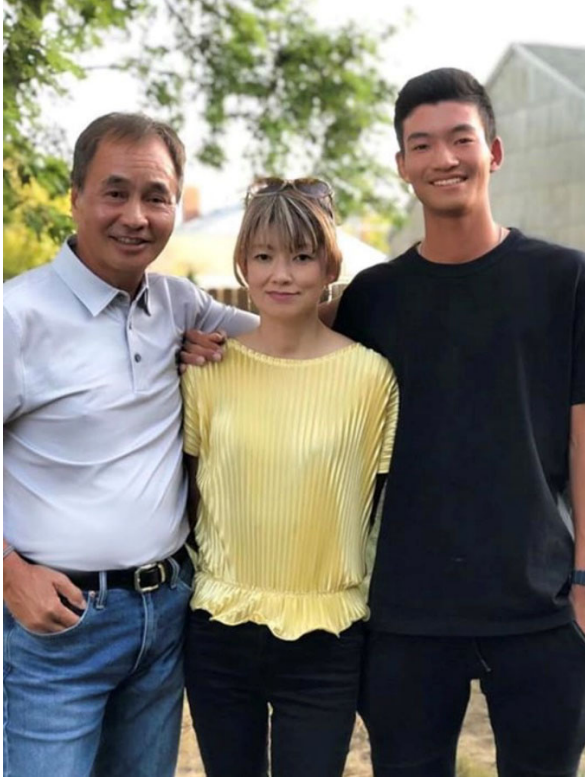
The Kho family

This press release is issued by Discovery Bay Golf Club.