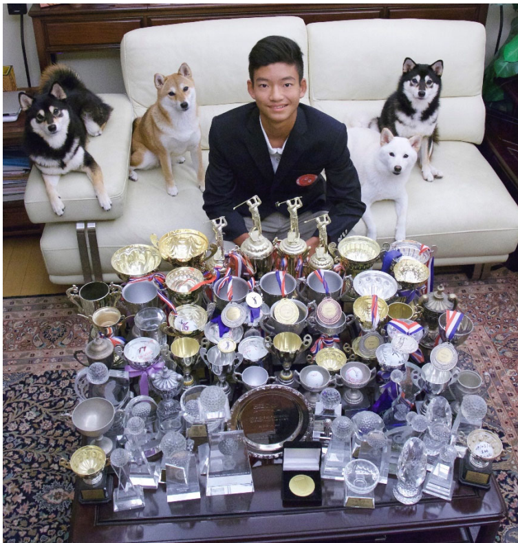
Winner of HKGA Junior Order of Merit in 2015, 2016, 2017 and 2018